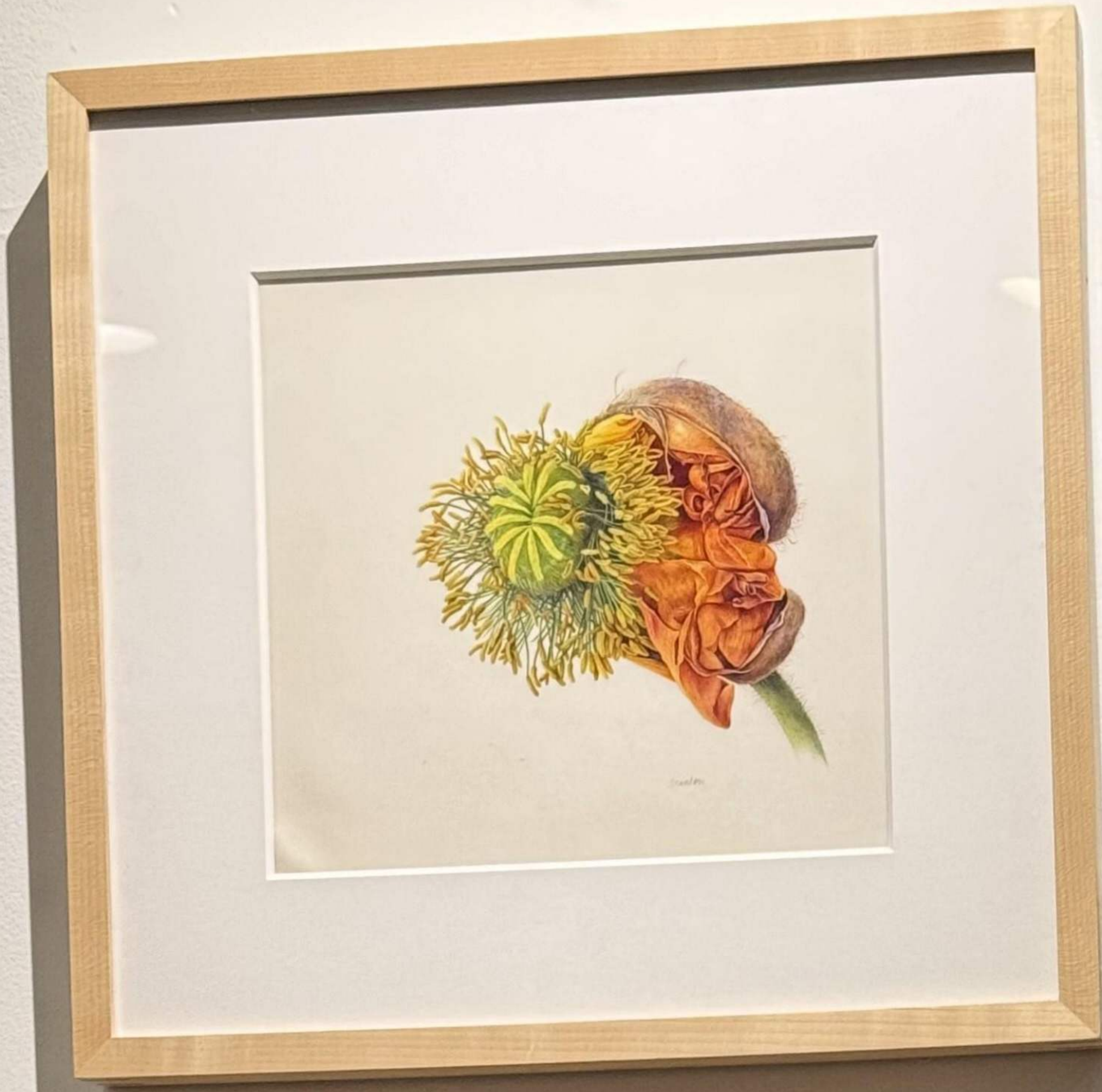
Connie Scanlon Minnesota, US "Opening Night" Oreococcus maritimus Watercolor on vellum 2023