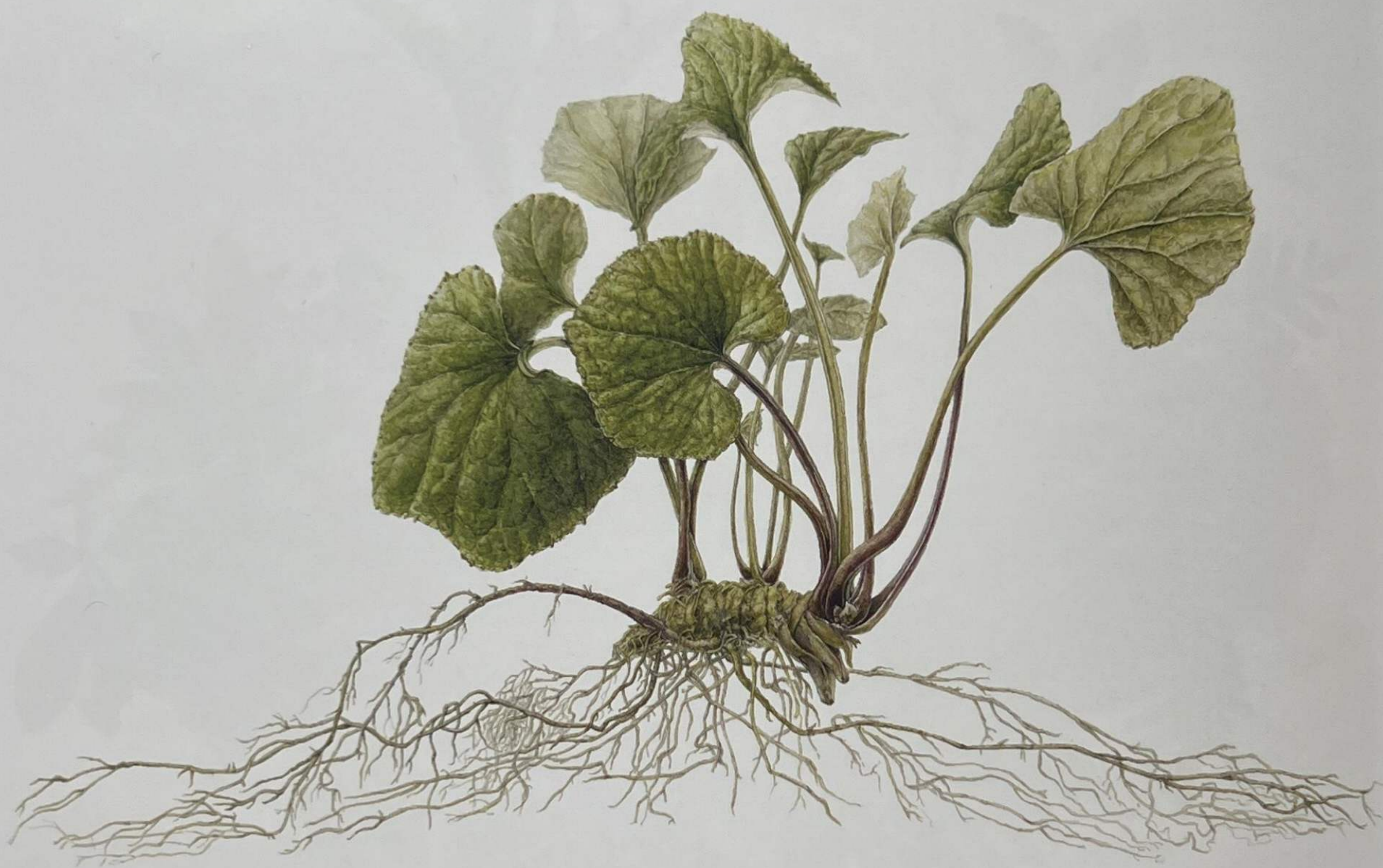
Plate 24 KAORU TAKAISHI Mitaka Osawa Wasabi Eutrema japonicum Watercolor on paper 11-1/2 x 16 inches